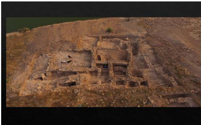
Fig. 3. A view of the Tomb of the Cham-papi Cemetery.