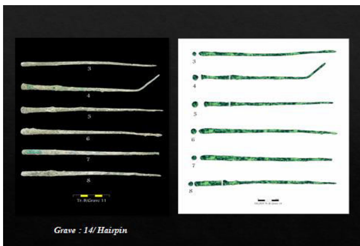
Fig. 5. A view of the Bronze Burner, grave 14