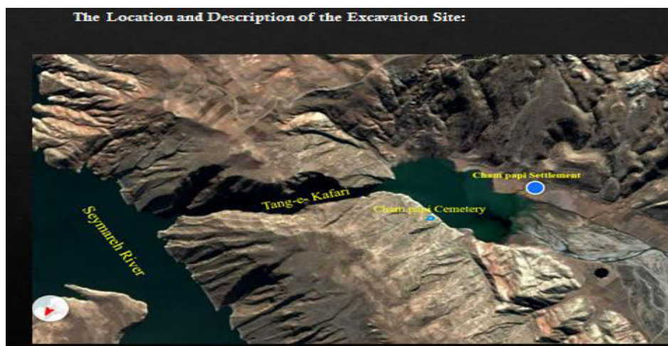
Fig-1. The location of the Kaferi strait in the middle of the catchment area of the Seymare Dam