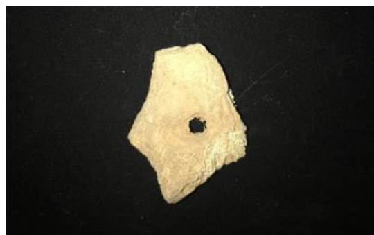
Fig. 8. View of Distal humerus