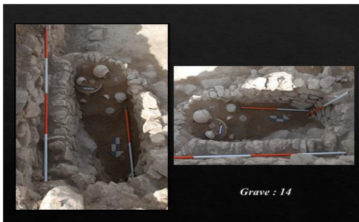
Fig. 4. A view of grave 14, workshop B