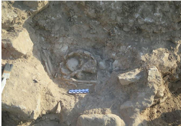
Fig. 9. The skeletal remains of grave, 24