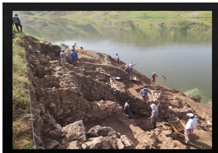
Fig-2. Explore part of the tomb of the Cham-Papi Cemetery